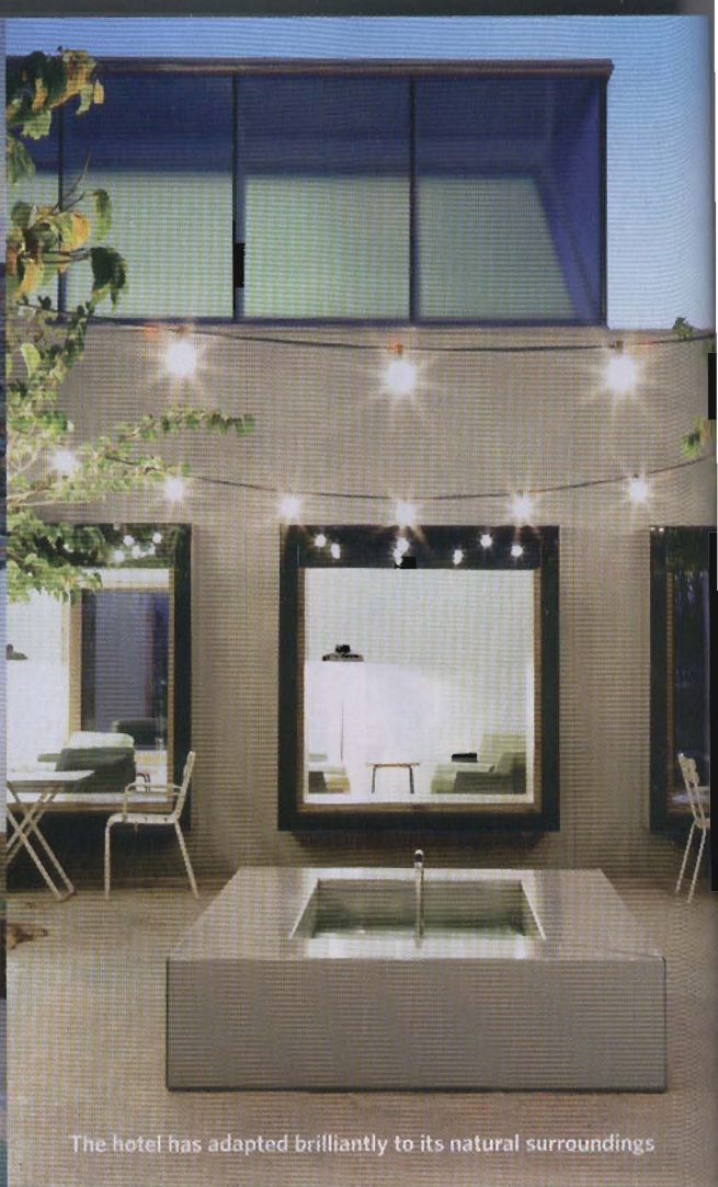
The hotel has adapted brilliantly to its natural surroundings